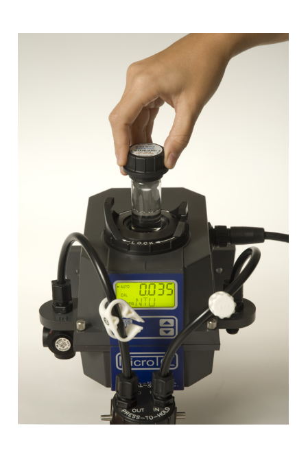
MicroloL with Calibration Cuvettes A complete primary calibration can be completed in less that five minutes