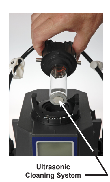
Keeps the optical chamber clean in finished or raw water applications.

The sensor shall consist of a rotational flow through assembly with a 30ml cuvette. The specially designed flow head bubble rejection system eliminates the need for a bubble trap and ensures an immediate response time. The sensor shall be able to accommodate grab samples. Calibration and standardization will be accomplished using small volumes (30ml) of reusable primary standards in a cuvette. The Primary Standards shall be reusable for multiple online turbidimeters and be interchangeable with laboratory turbidimeters. Calibration procedures can be completed without disrupting the sample flow. The lamp source and detector shall not come in contact with the sample, eliminating false low readings. The turbidimeter shall use menu driven software for user ease. The turbidimeter enclosure shall be NEMA 4X (IP66) and suitable for outdoor installation. The Online Turbidimeter shall be HF scientific Microlot Online Turbidimeter.