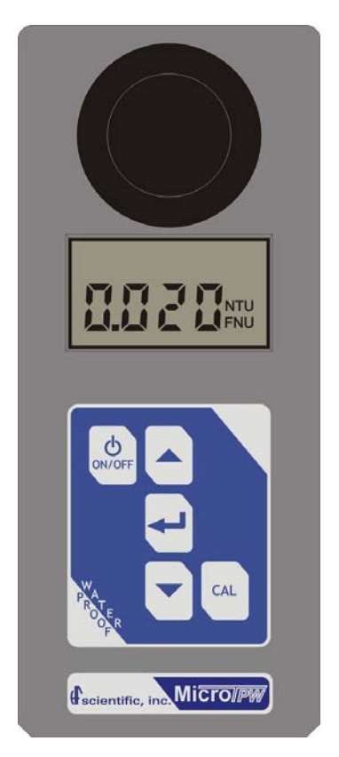
Figure 1: Top view of the instrument (MicroTPW shown).

Figure 1 is a depiction of the top of the instrument. The three main components of the instrument are the sample well, the display, and the touch pad. The following sections will describe the functionality of the display and the touch pad. The proper use of the instrument and the sample well will be discussed in later sections.