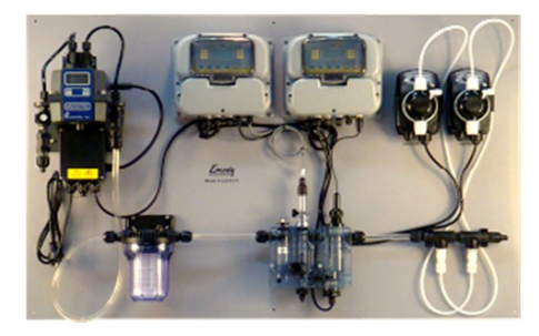
Chlorine Dosing and pH Correction with Turbidity Monitoring