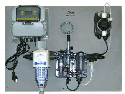
Chlorine Dosing with Self Cleaning Pre-Filter