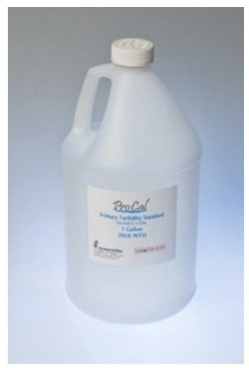
ProCal gallon For Hach® 1720