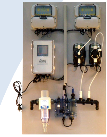
Chlorine Dosing and pH Correction with Data Logging