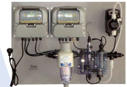
Chlorine Dosing and pH with Self Cleaning Pre-Filter