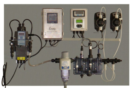
Chlorine Dioxide Dosing, pH Neutralisation Turbidity Monitoring with Recording and Data Logging