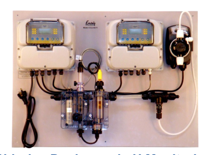
Chlorine Dosing and pH Monitoring