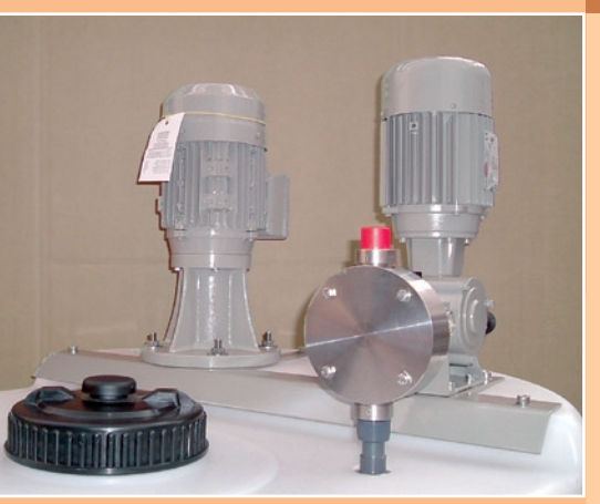
Dosing unit with DEM mixer