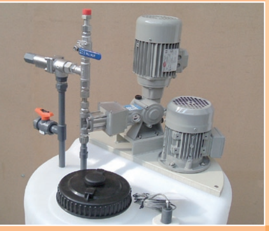
Dosing unit with DAM mixer

DOSEURO, company specialized in developing and manufacturing of dosing pumps, has created a complete range of mixers to face and solve problems in many industrial applications such as chemicals production, water treatment and food production. Our mixers are built according to CE regulations and are marked and documented accordingly.