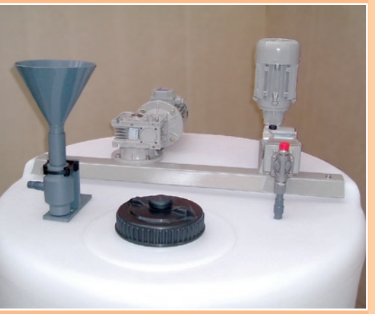
Dosing unit with DRV mixer